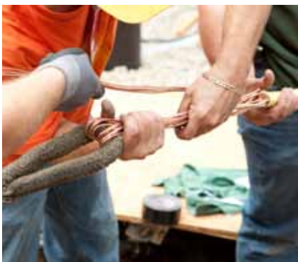
Eliminates making up the head