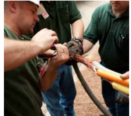
Eliminates re-working head