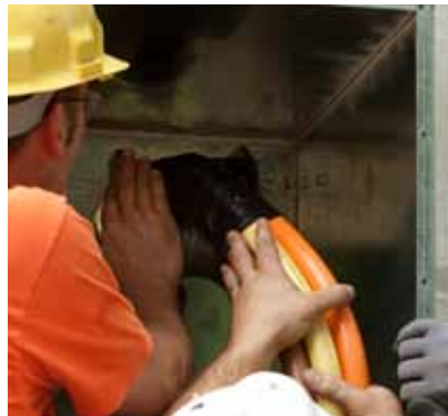
Eliminates bulky heads getting stuck in conduit